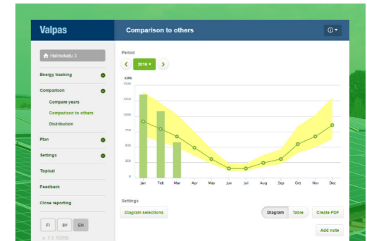
Fortum Valpas desktop and mobile view